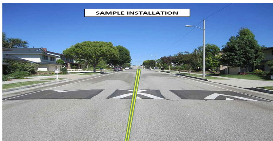
Figure 3.11.1. Speed Cushion with Passage that Straddles Centerline