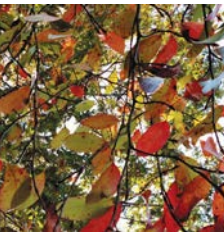
Black Tupelo or Gum