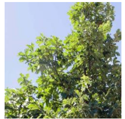
Swamp White Oak