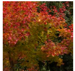
American Red Maple