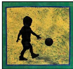
Barbara Dahlberg Child's Play / Art Quilt / $275