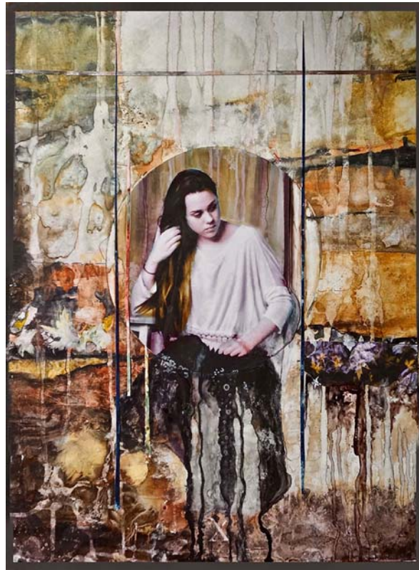
Annette Uroskie Madonna of the Rocks / Collage / $600