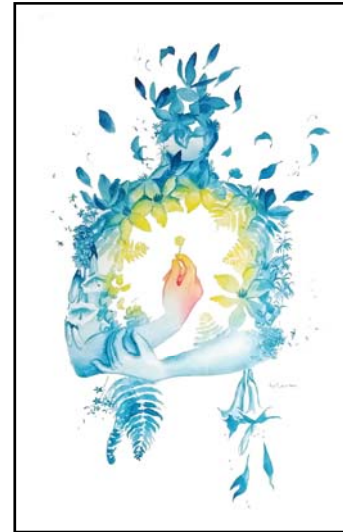
Holly Carton Loss of Self / Watercolor / $250