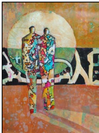
Kay Fuller Fenced In / Acrylic on Paper / $245