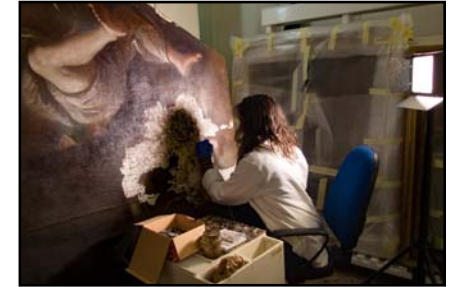
Wanda Prather Modern Masters: Restoration Lab / Photography / $75