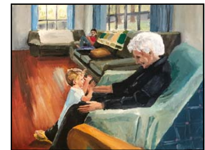
Blandine Broomfield Great Grandson / Oil / $900

More images can be seen at: https://flic.kr/s/aHsmBpSVV8